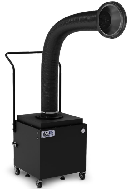
Model 400/450 Portable Floor Sentry

A smaller model [SS-300-PFS] and a larger model [SS-500-WFE-MP1] are also available.