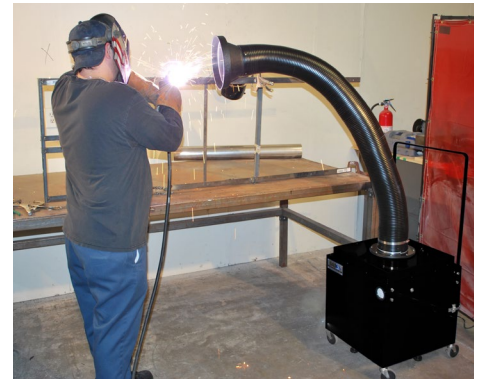
The Model 400/450 Portable Floor Sentry helps protect the operator from fumes by extracting at the source.